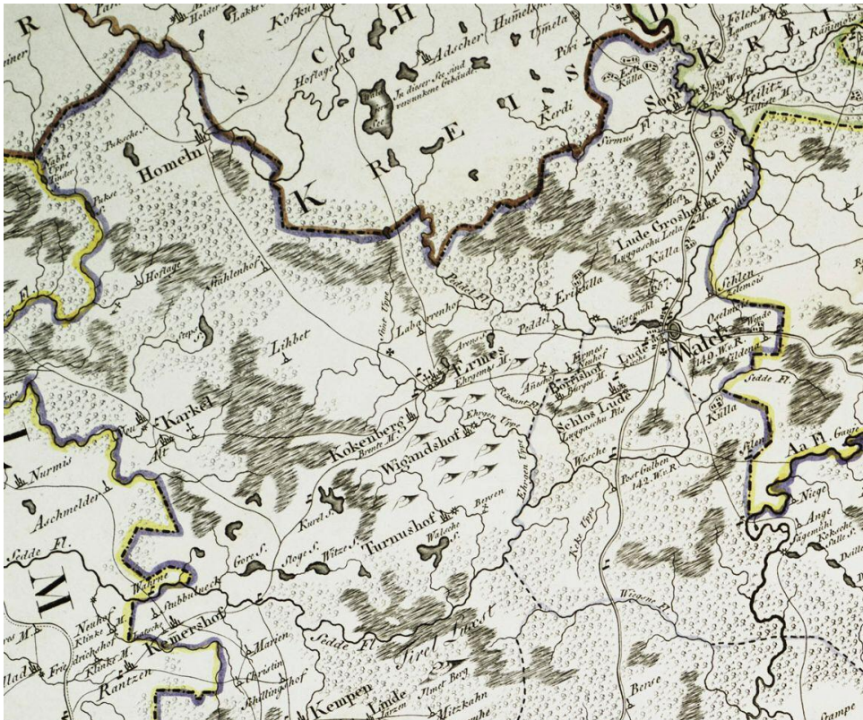
Map 1. Valka (Walck) District [drawn by] L[udvig] A[ugust] Graf Mellin; engraved by Carl Jäck, Berlin 1793. Scale [approx. 1:200,000], [Riga] 1793] (Atlas von Liefland oder von den beyden Gouvernemenentern u. Herzogthümern Lief- und Ehstland und der Provinz Oesel, Riga—Leipzig 1798. Kt L1-1/90 ( http://data.lnb.lv/nba05/kartes/PDF/173.pdf ) [fragment]).

Regrettably, the practice of attributing the same name to both the castle and the manor often results in our ability clearly to identify the object in question. For example, in a letter of 11 June 1438 reference is made to a certain Bartholomäus von Argemes and zu Argemes (LG I, Nr. 294 : 279–280), whereas in a document dated 30 June 1463 reference is made to Bartolomeus Ermes Leuten , Ergemisz and Ergemische beck[e] (LG I, Nr. 411 : 369–370); however, aside from Ērgemes River, the other named objects cannot be uniquely identified, even when account is taken of the name Bartolomeus .