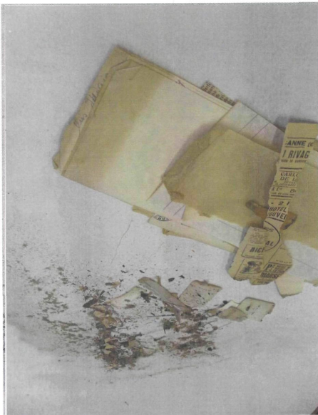
Fig. 2. In conservation of process