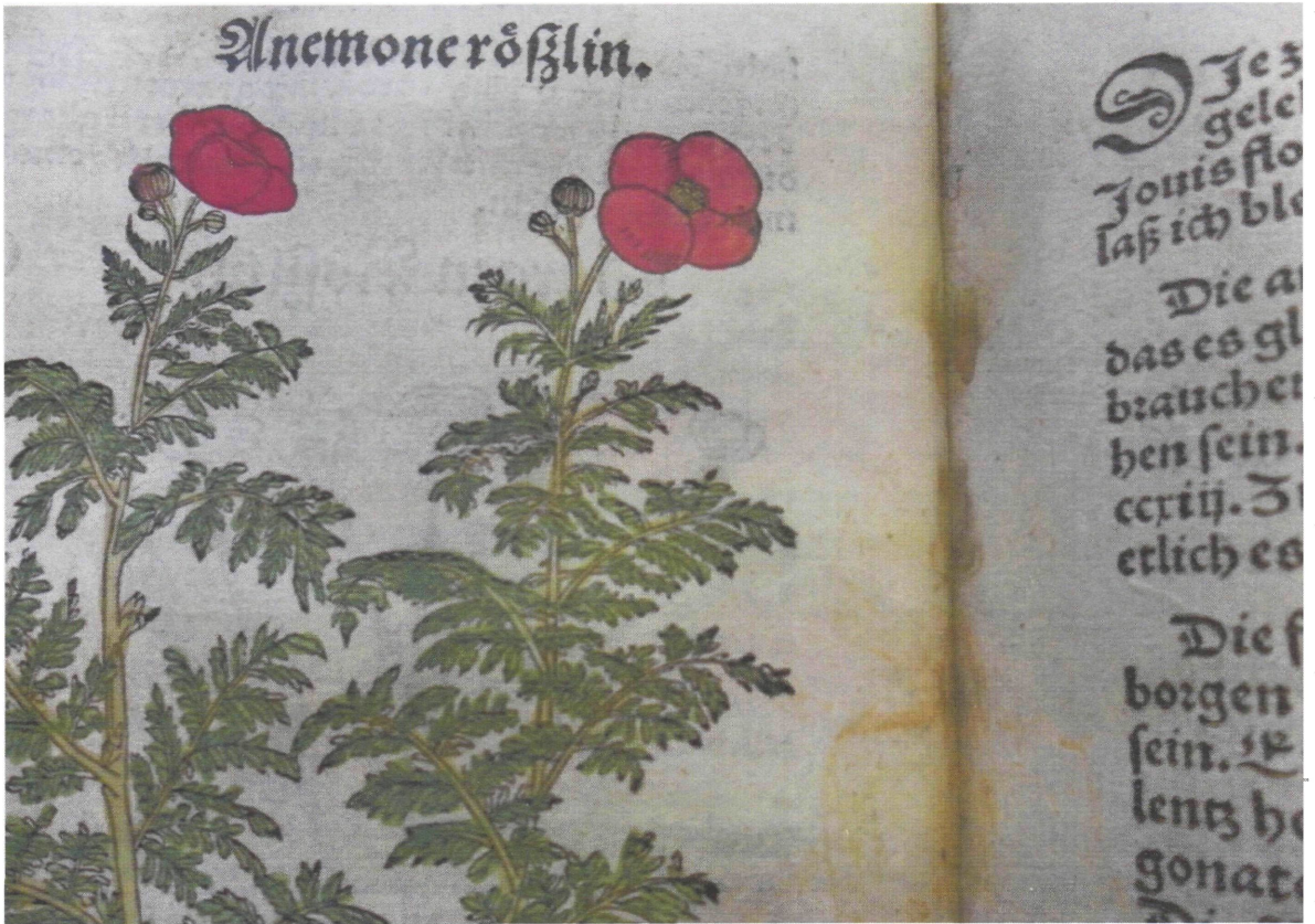
Fig. 1. Before conservation