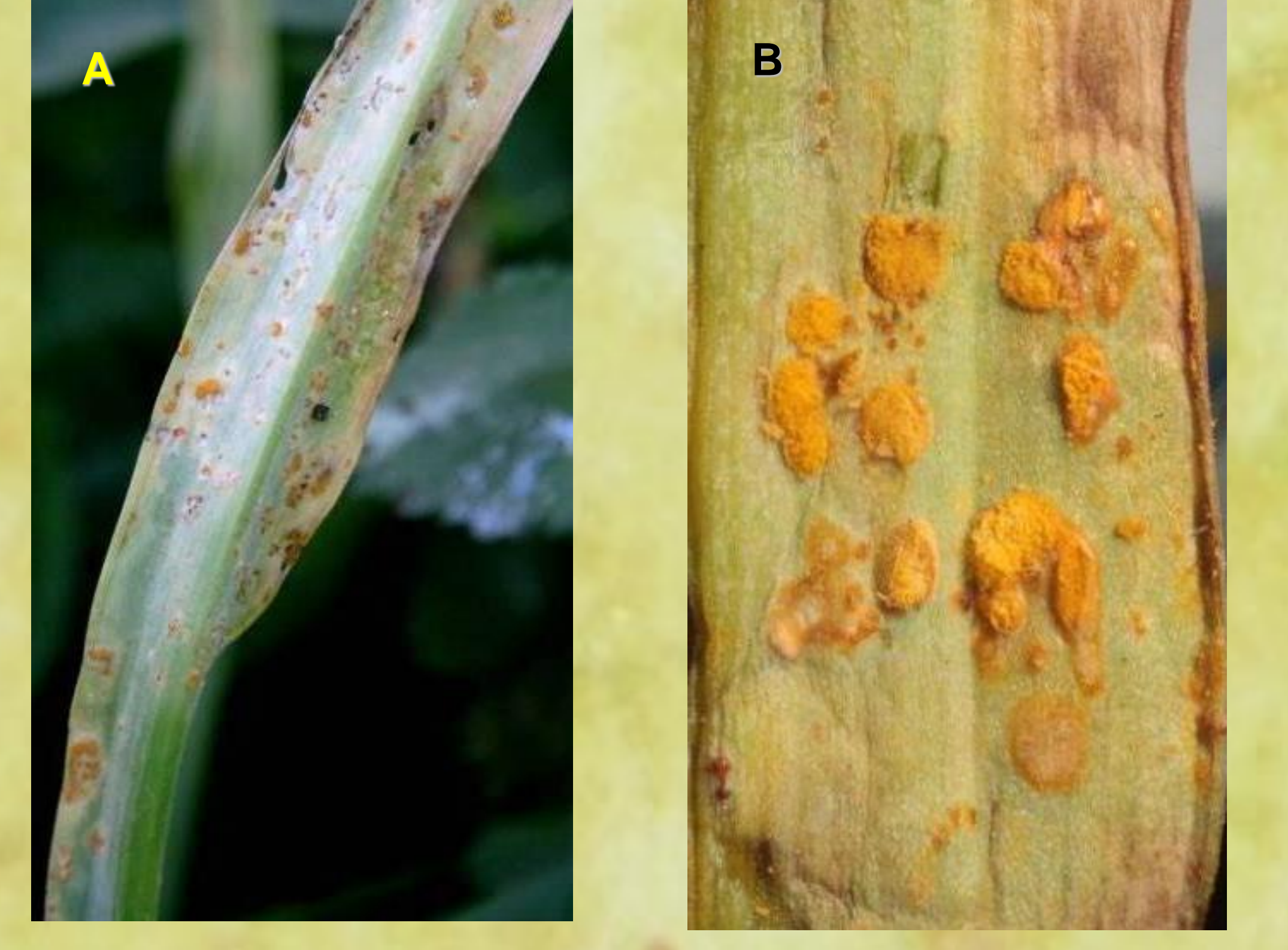
Fig. 3 Rust lesions on Galanthus plicatus: A - infected leaf; B - pustules on the leaf surface.