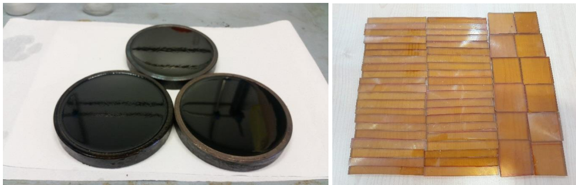
Figure 1. Steel moulds with the epoxy filled with 0.05 wt. % of CNT (to the left) and epoxy samples cut for flexural and thermophysical tests (to the right).

One set of NC specimens at certain filler content was prepared in IPCB during Mobility#4 by using the most optimal processing route (see D2.2). Prepared materials: RTM6 epoxy resin, RTM6 filled with 0.05 wt. % of carbon nanotubes (CNT), RTM6 filled with 0.3 wt. % of carbon nanofibers (CNF), and RTM6 filled with 0.1 wt. % of CNT/CNF in the ratio 1:1 by mass. For each material type 5 discs with diameter 8 cm and thickness 3 mm were prepared and cut into samples (Figure 1). The characterization of flexural, thermophysical and electrical properties was performed for all materials in uncondensed state (before the environmental ageing). The test samples were subjected to the 1 st season of full year environmental ageing (summer, water absorption at 20°C).